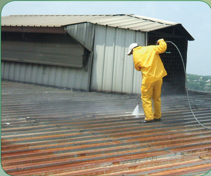
PREPARE THE ROOF Prep and clean the roof removing dirt and debris.