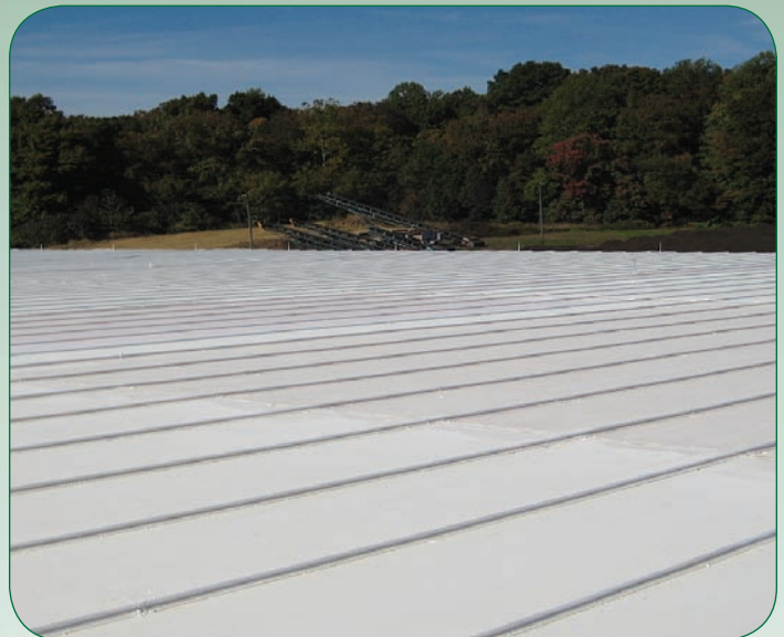
Apply two coats of the recommended product to achieve desired mil thickness.