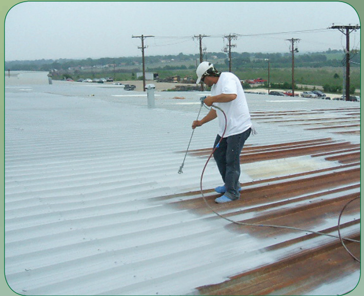
APPLY PRIMER to all rusty areas.